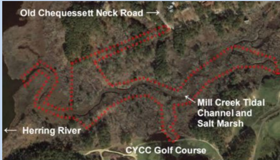
Figure 3 — General Project Location